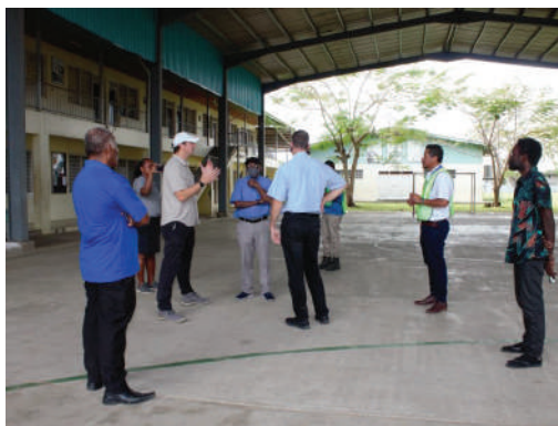
Don Bosco school (Henderson), another of the existing venues to be used in next year's Games.