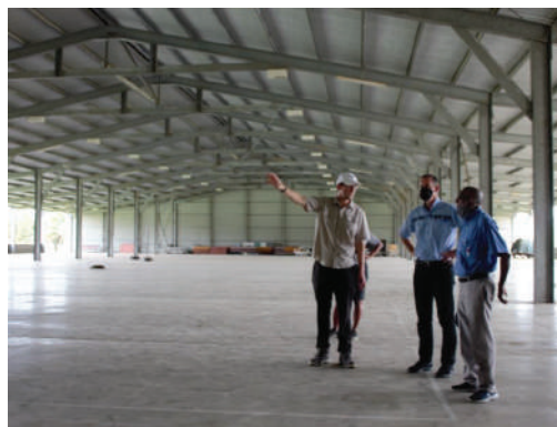
Maranatha Hall (Burns creek) one of the existing venues for next year's Games